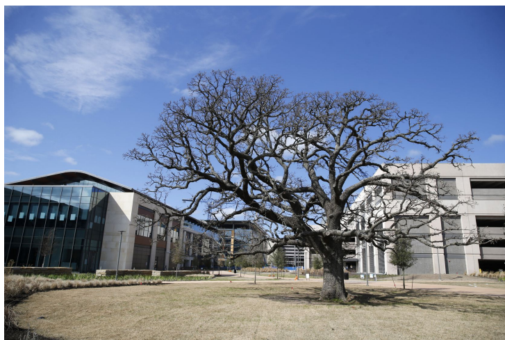
A 200-year-old tree in the center area of the buildings at Charles Schwab’s new headquarters in Westlake.

Starting about a decade ago, the company decided to start swapping some of its big, generic leased spaces for custom-built office centers that it would occupy long-term.